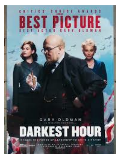
DARKEST HOUR (2017) May 18th