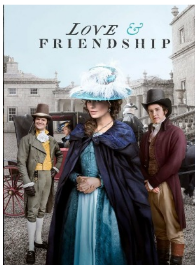
LOVE and FRIENDSHIP (2016) September 22nd