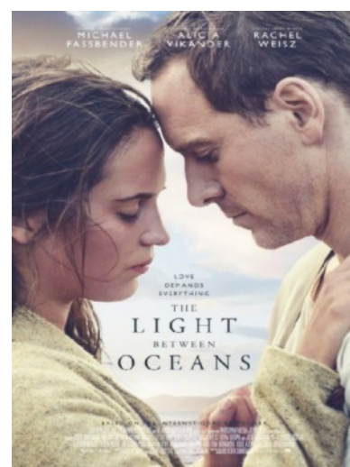
The LIGHT BETWEEN the OCEANS (2016) November 17th