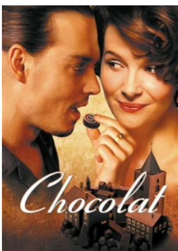
CHOCOLAT (2000) January 19th