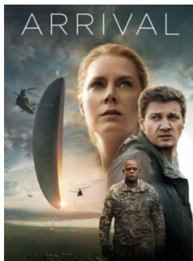
ARRIVAL (2016) December 15th