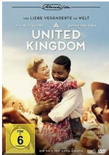
A UNITED KINGDOM (2016) October 20th