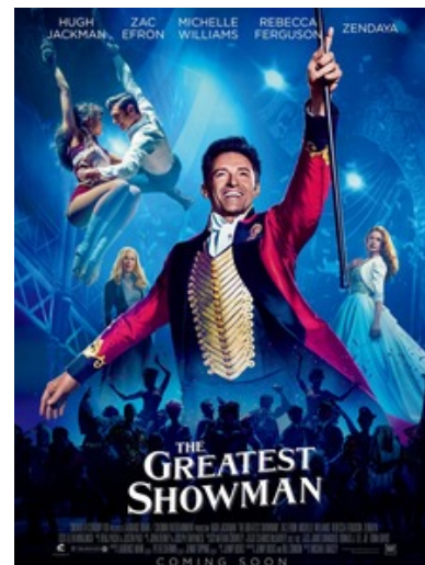
The Greatest Showman (2017) & annual dinner. February 16th